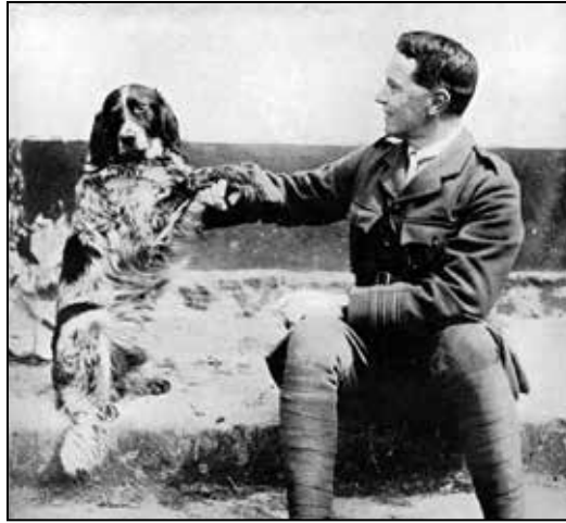
John McCrae, Canadian World War I soldier, poet, and surgeon.