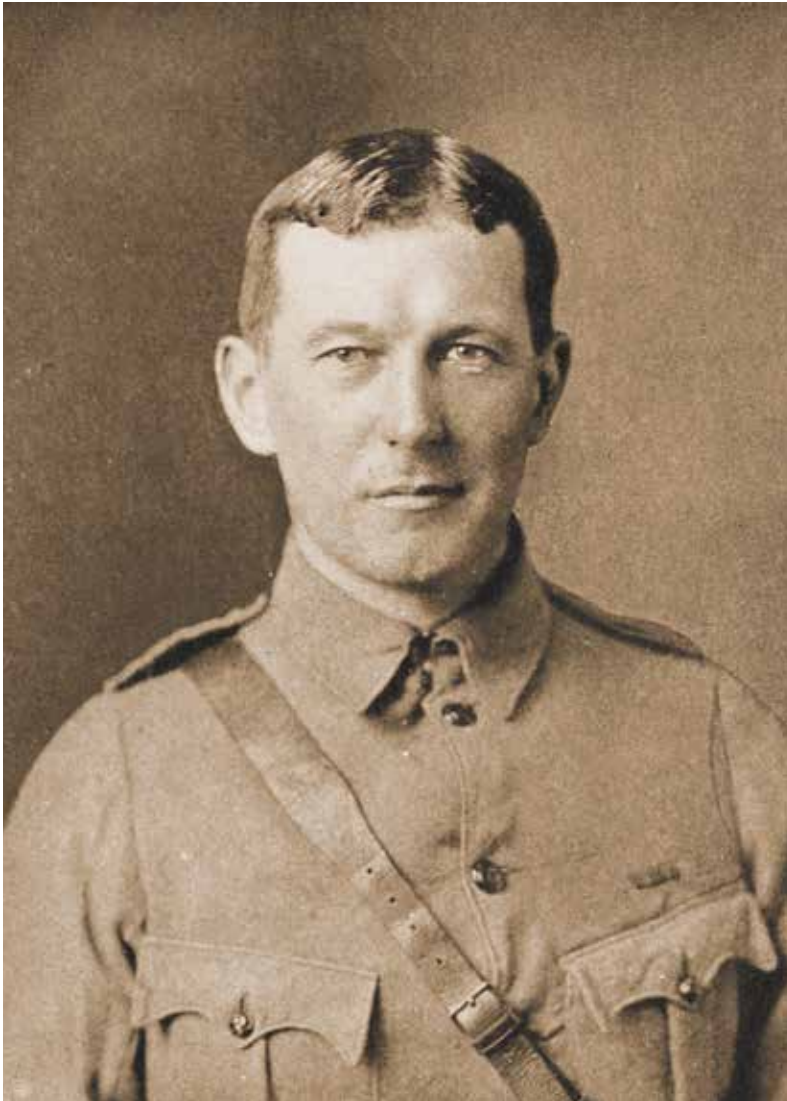
Lieutenant Colonel John McCrae, MD, Canadian Army Medical Corps.