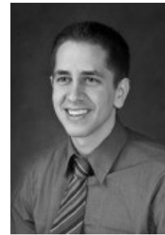
NEW FACES — Look inside this issue to learn more about the latest O'Brien Foundation Fellows